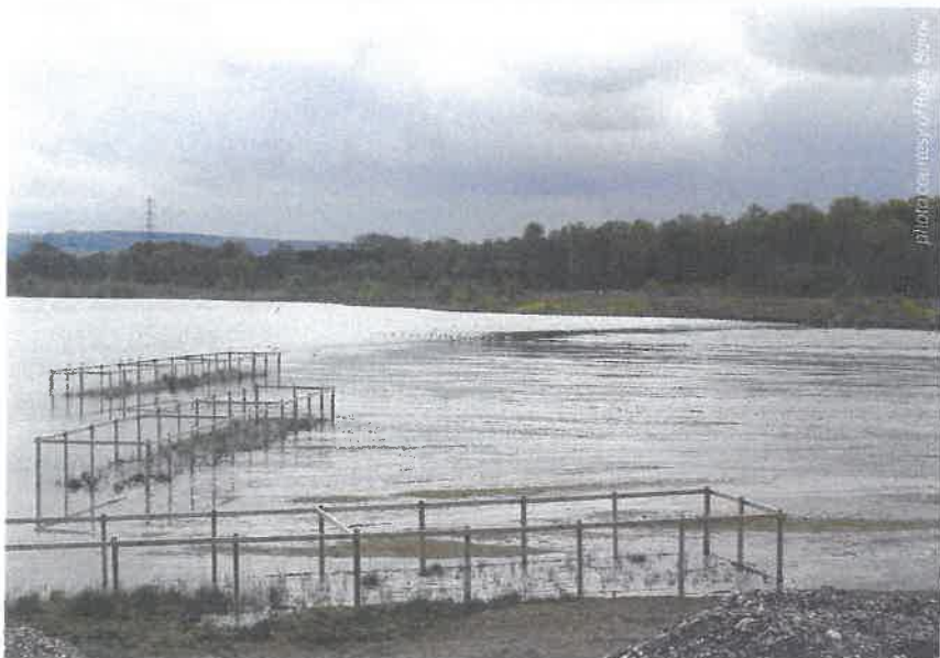
Figure 1: silt reed restoration in progress